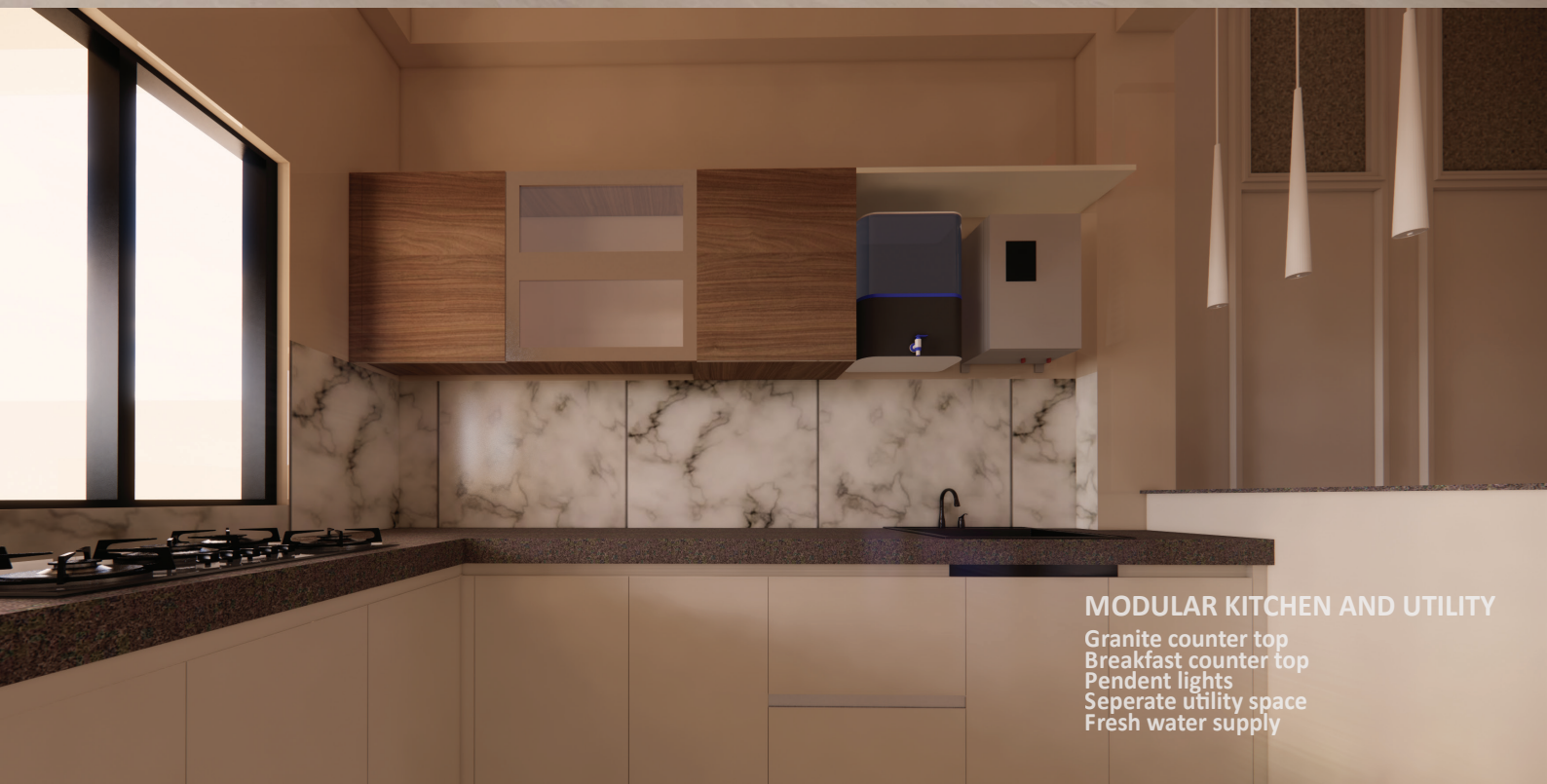
MODULAR KITCHEN AND UTILITY Granite counter top Breakfast counter top Pendent lights Seperate utility space Fresh water supply