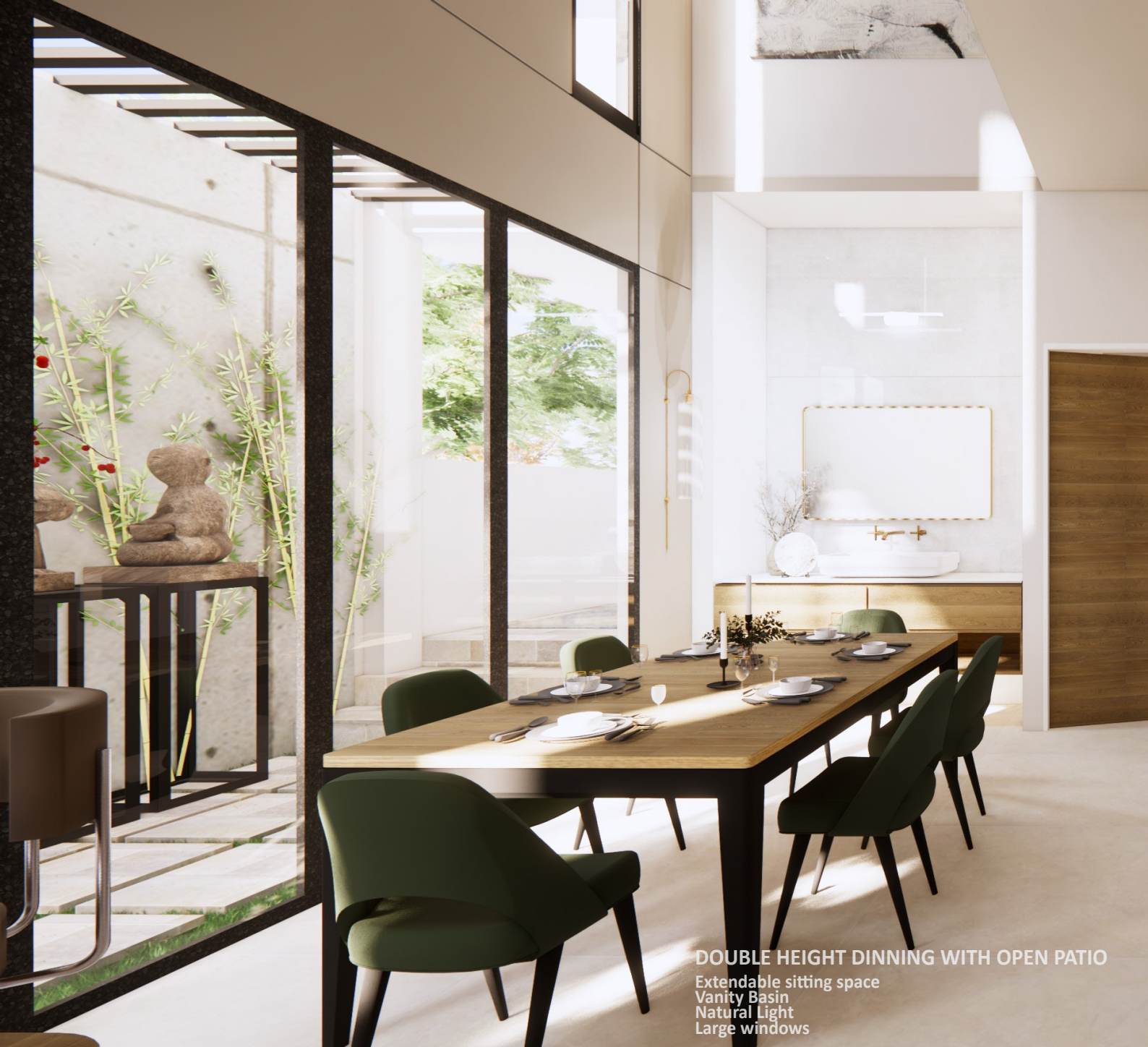
DOUBLE HEIGHT DINNING WITH OPEN PATIO Extendable sitting space Vanity Basin Natural Light Large windows