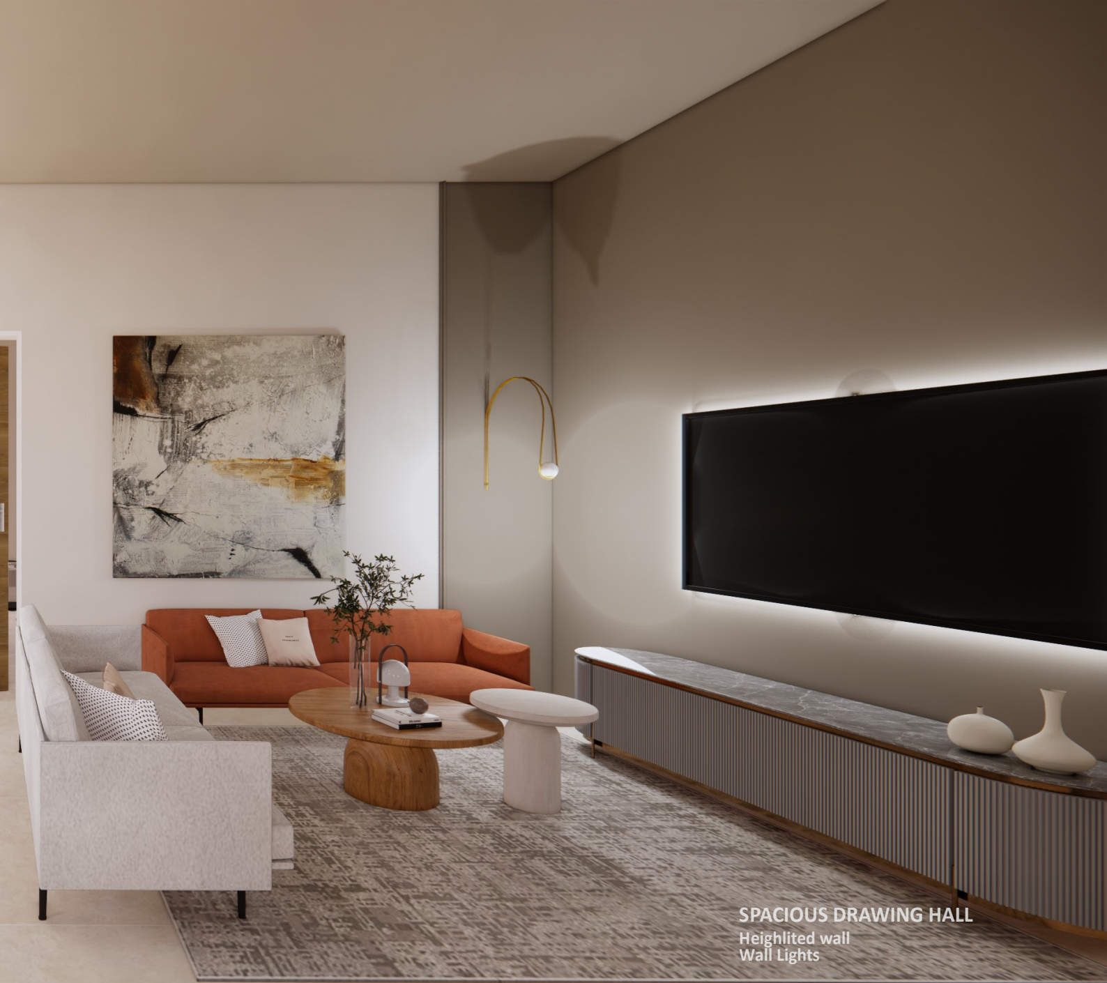
SPACIOUS DRAWING HALL Heighlited wall Wall Lights