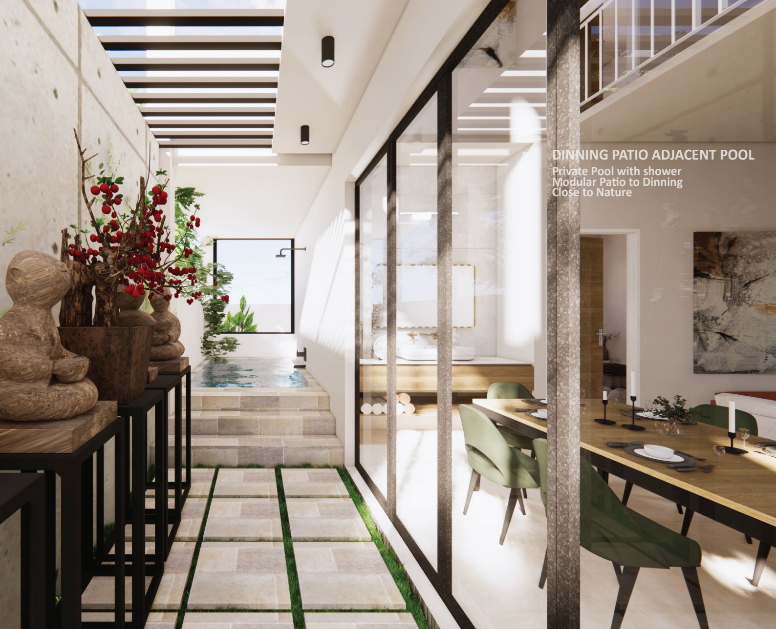
DINNING PATIO ADJACENT POOL Private Pool with shower Modular Patio to Dining Close to Nature