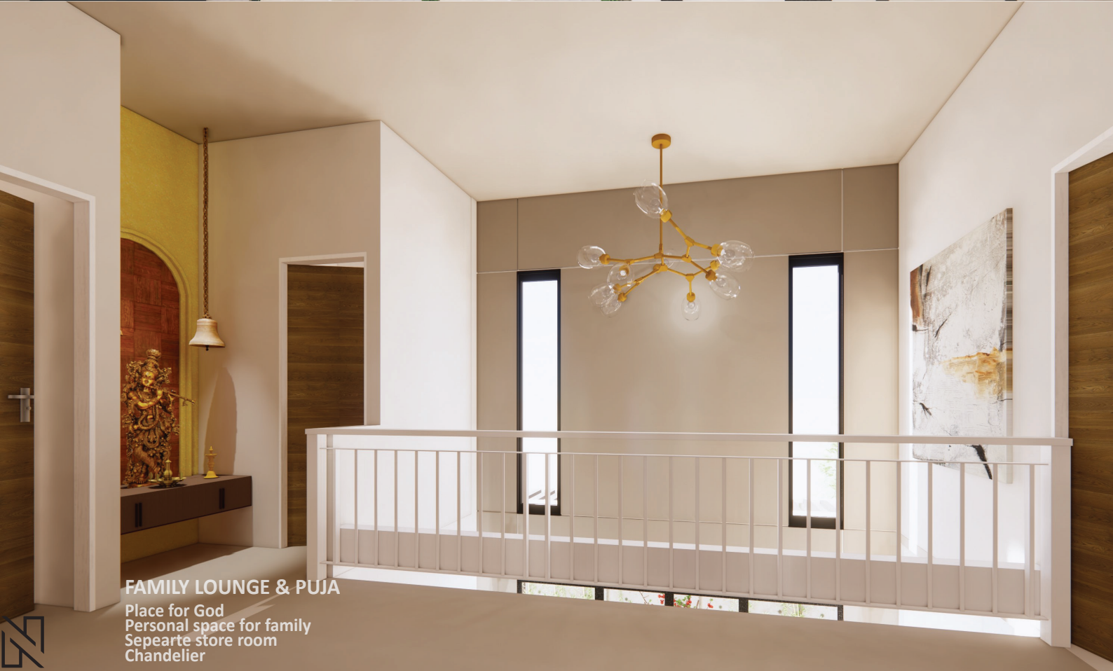
FAMILY LOUNGE & PUJA Place for God Personal space for family Seperate store room Chandelier