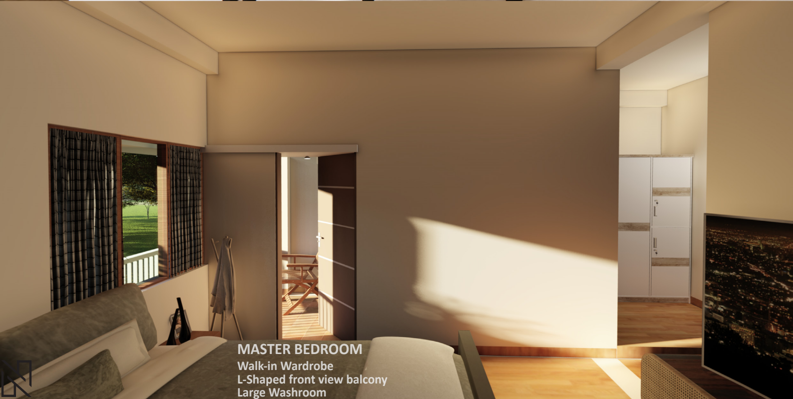
MASTER BEDROOM Walk-in Wardrobe L-Shaped front view balcony Large Washroom